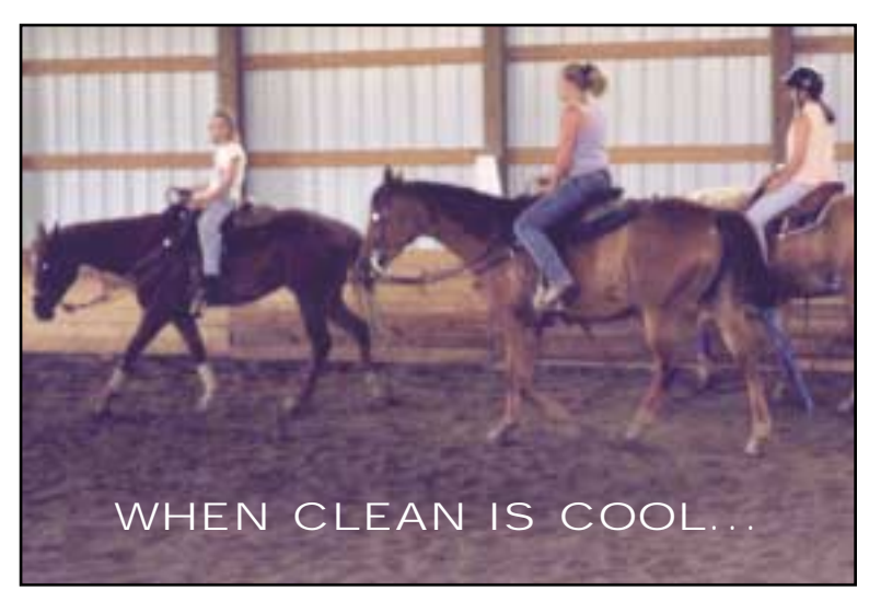
Look at the difference Arena Rx<sup>®</sup> makes!! Would you expose your horse or yourself to a dusty environment if you didn't have to?

The most obvious demonstration of the effectiveness of Arena Rx<sup>®</sup> ... is to <u>SEE</u> the difference. In the above photo, notice the untreated arena where "Dust Dominates". Imagine what this dust does to your horse's respiratory system. What about the rider?